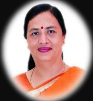
Smt. SEEMA TRIKHA Member of Haryana Legislative Assembly, Government of India