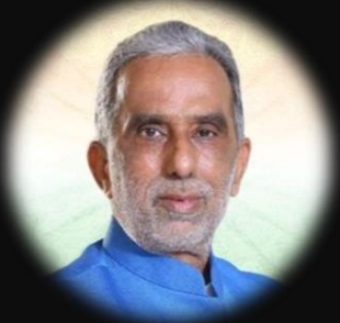
Shri. KRISHAN PAL GURJAR Minister of State Of Power and Heavy Industries, Government of India