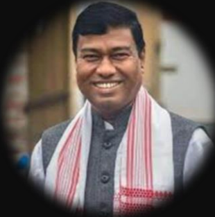
Shri. RAMESWAR TELI Hon'ble Minister of State for Labour & Employment Petroleum and Natural Gas Government of India