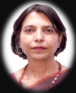
Ms. ARTI AHUJA Secretary, Minister of Labour & Employment, Government of India